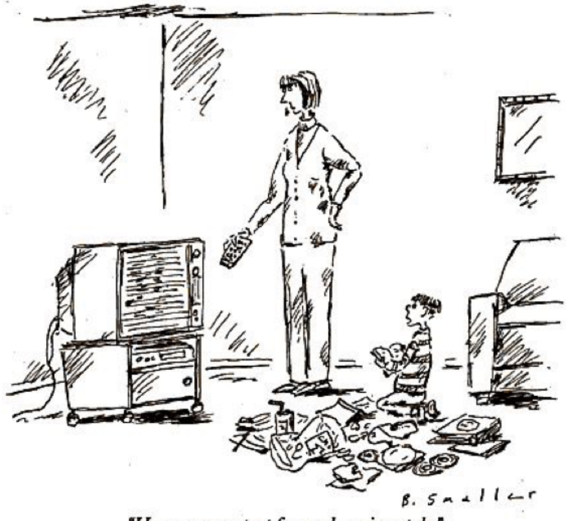
"Have some respect for my learning style."